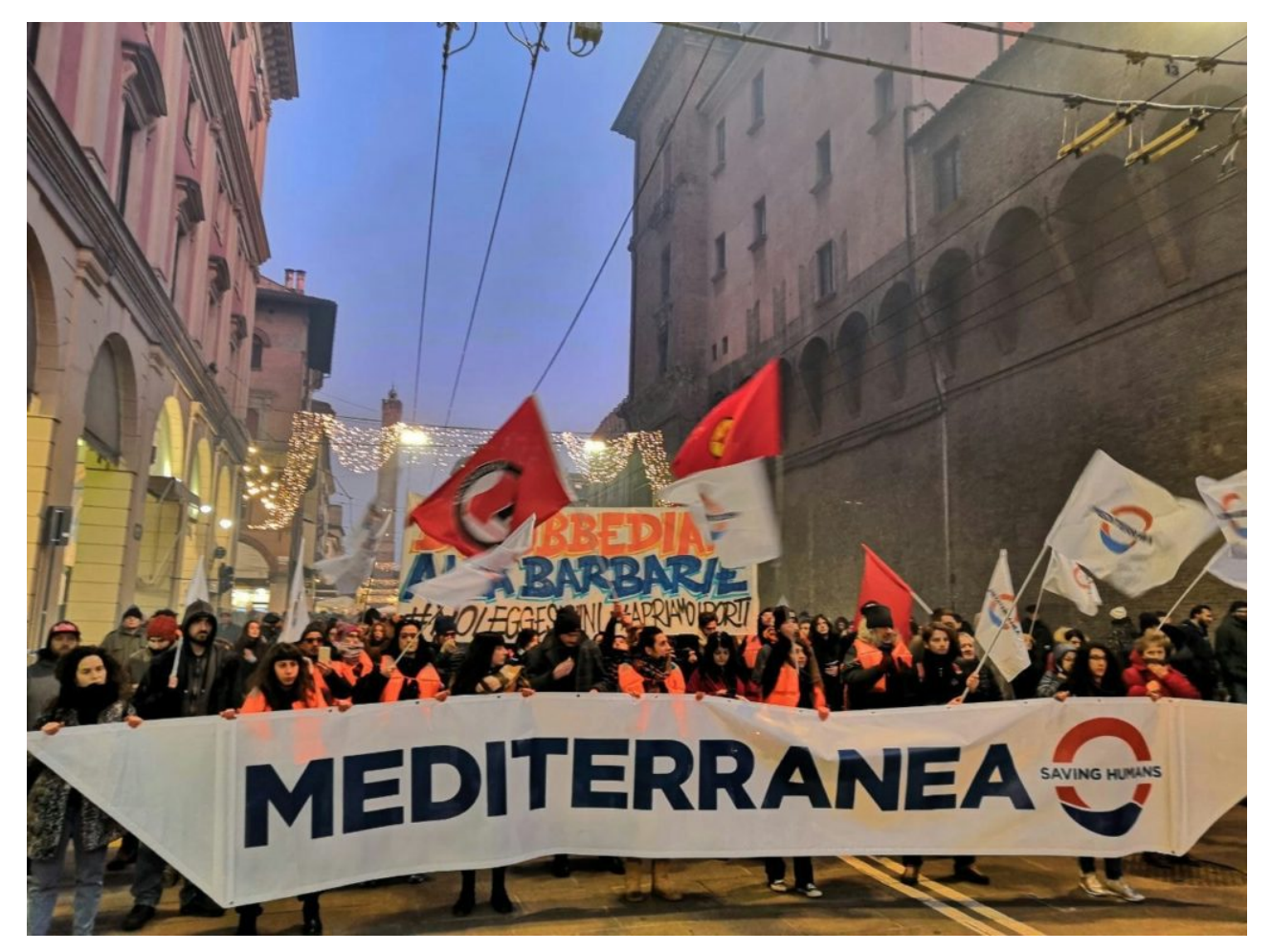
Mediterranea contingent at a demonstration in Bologna.