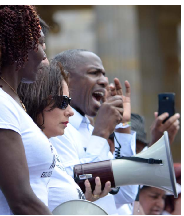
Activists at a peace demonstration in Colombia.

Targeted civil society activists are often those involved in environmental and land issues, and those who seek to uphold indigenous peoples' rights. The worrying situation for civil society rights in the context of natural resource exploitation is not new. In a 2015 report by Maina Kiai, special attention was