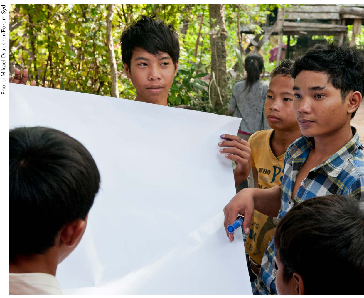
Young people engaging in a project, encouraging Cambodian youth to actively participate in social development activities

The Working Group is made up of 14 governments, (Botswana, Canada, Chile, Czech Republic, Denmark, Estonia, Mongolia, the Netherlands, Poland, Slovakia, Spain, Sweden, Tanzania and the United States). It includes four civil society organisations with expertise in laws governing civil society, (ARTICLE 19, CIVICUS, ICNL, the World Movement for Democracy (WMD and Act Alliance)); and three advisory organisations, (UNDP, the UK Charity Commission and the UN Special Rapporteur on the rights to freedom of peaceful assembly and association).<sup>72</sup>