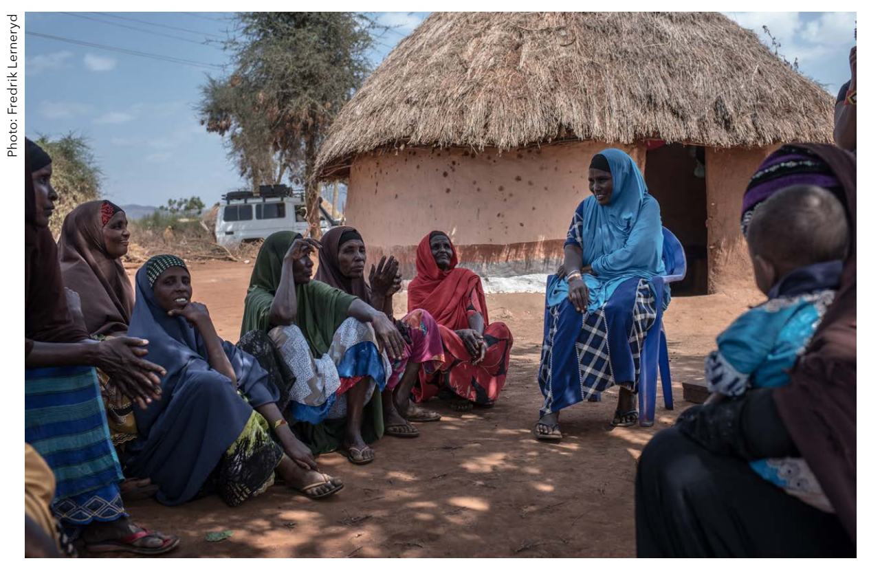
Members of Kinisa Women's Group, Moyale, Kenya.