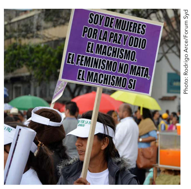
Peace activists in Colombia 2013.

It is important to note is that in recent years, the financial and economic crisis, changes of political priorities of governments, together with critical assessments of development outcomes, and the emergence of new actors in the field of international development co-operation, have also had an impact on funding support for CSOs.<sup>28</sup>