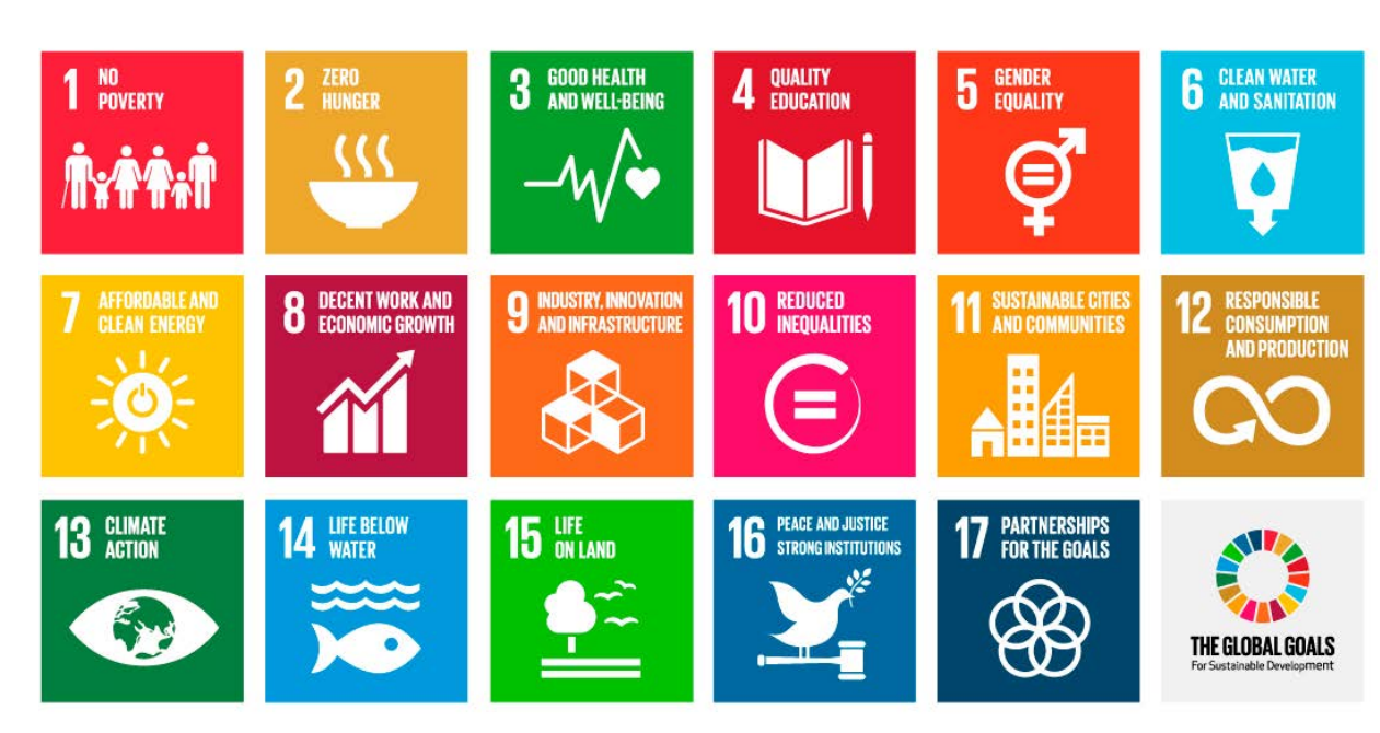
The Global Goals. For sustianable development

oversight, monitoring and review, with full and meaningful participation of civil society organizations'.<sup>78</sup> Also, concerns were raised over how unconditional support for public private partnerships, and the lack of commitment for untied aid, could lead to long lasting effects on civil society.<sup>79</sup>