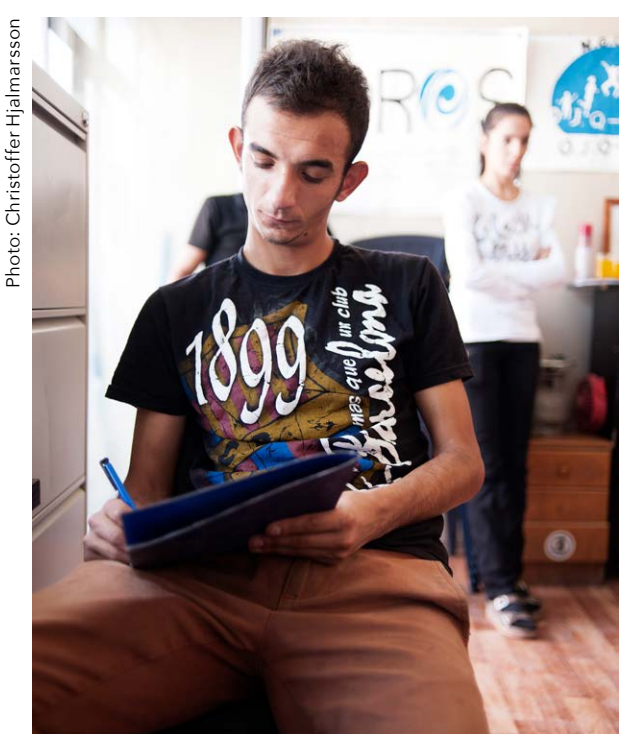
Member of Ferizaj Youth Club.

of communities. CSOs publicly advocate for challenges or opportunities, support or develop strategies to meet targets of the SDGs and the former MDGs. CSOs also work with governments to implement programmes and monitoring and evaluating efforts to achieve the Goals.<sup>94</sup>