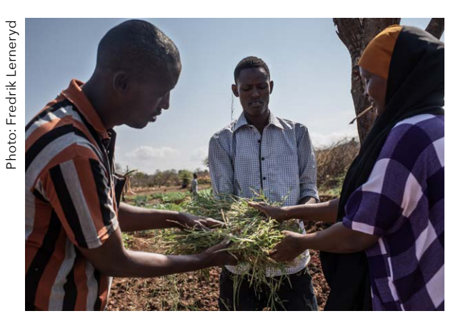
Members of Yabalo Youth Group.

Human rights work is a requirement for global sustainable development. Civil society's role in implementing the 2030 Agenda by holding states accountable, monitoring and reporting on progress and impediments, is necessary to achieve the 17 Global Goals. Specifically, Goal 16, on peaceful and inclusive societies; Goal 5 on gender equality; and Goal 17 on partnerships that serves as a foundation in the new development agenda when to work for a more enabling, inclusive and open space for civil society. None of these goals can be achieved, or sustainable, if human rights are violated or the space for civil society is shrinking.